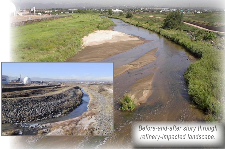
Before-and-after story through refinery-impacted landscape.

To learn more about this project and others along the greenway, come on tours Sept. 21 from 4 p.m. until 6 p.m. or Oct. 14 from 10 a.m. to noon. Experts from Suncor, Metro Wastewater Reclamation District, Xcel and naturalists will be on hand. The tour will begin at the Administration Building at Metro Wastewater at 6450 York in Denver. To attend you must RSVP to SCRGP on our website or 303-468-3260.