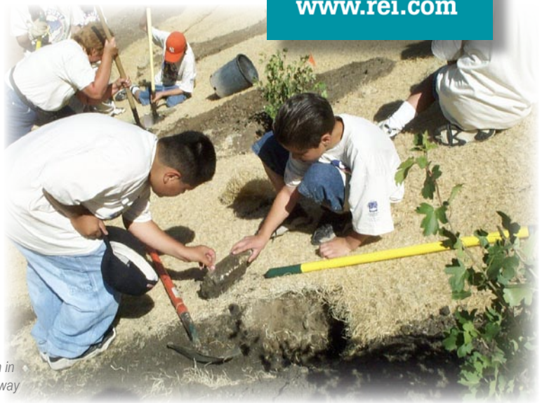
Volunteers pitch in along the Greenway